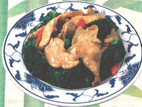
Chicken w. Broccoli