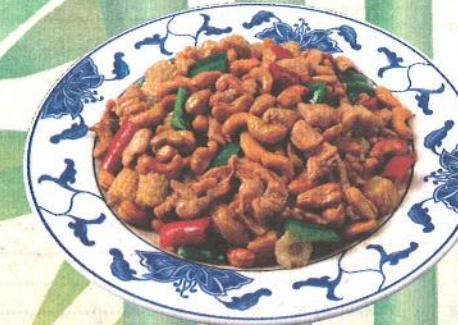
Chicken w. Cashew Nuts