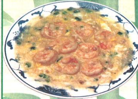
Shrimp w. Lobster Sauce