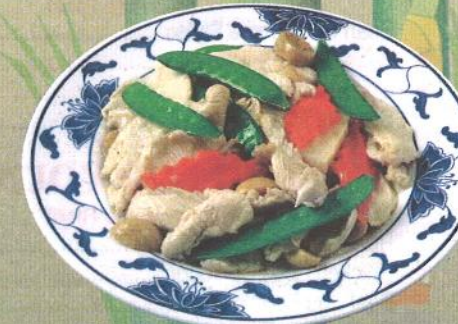
Moo Goo Gai Pan