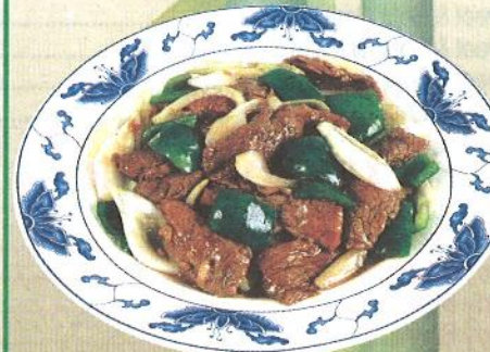
Pepper Steak w. Onion